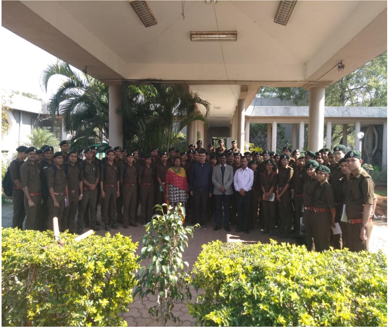
IFB Officials and Trainee F.R.O's