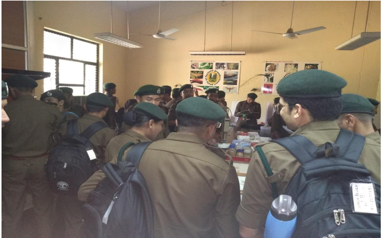
Trainee Forest Range Officers in Entomology Laboratory