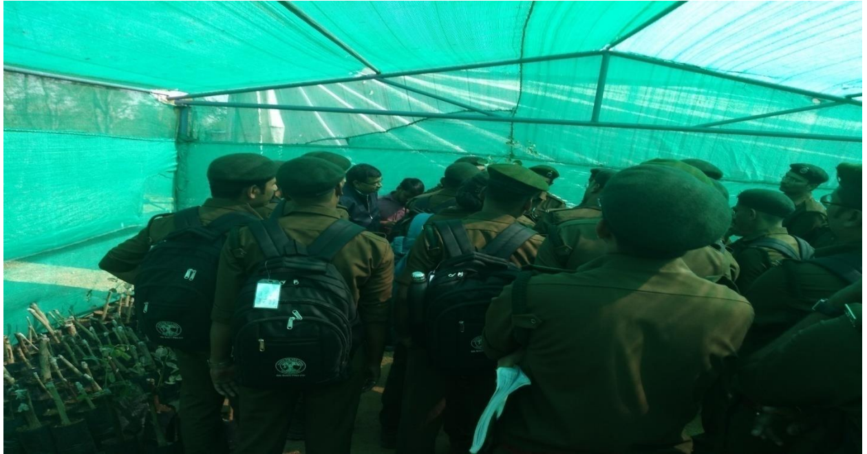
Trainee Forest Range Officers in Poly House cultivation of Red Sanders