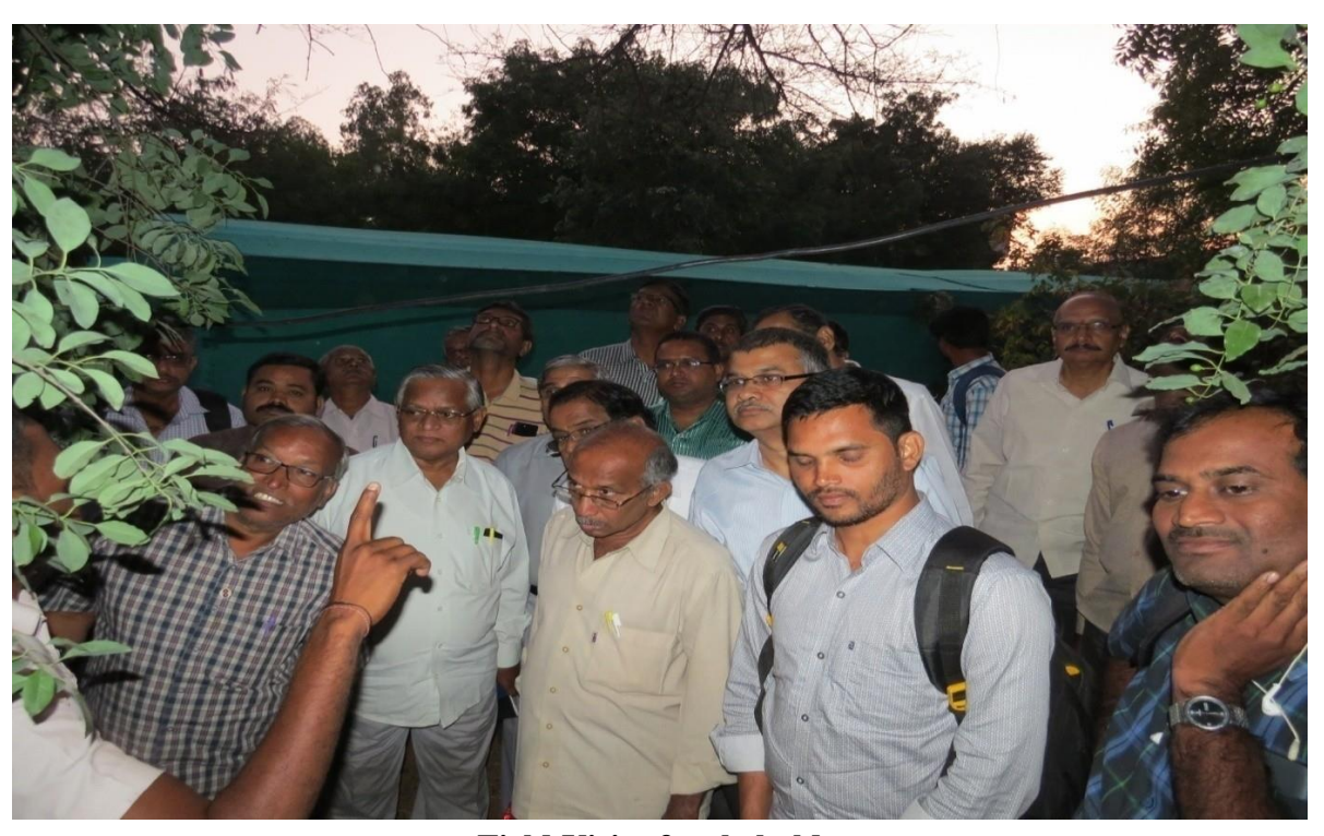
Field Visit of stakeholders